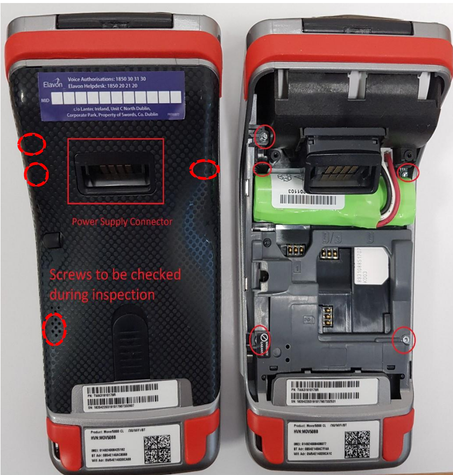
Rear View Casing Closed