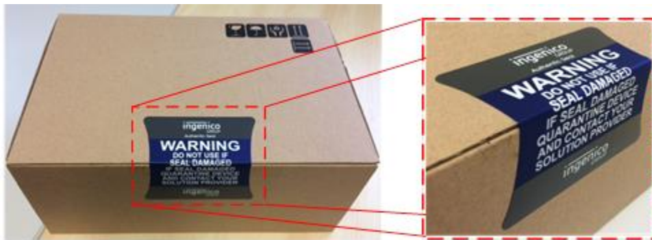
Tamper Evident Seal (TES)

Engineer On-Site Configuration deliveries will be delivered in a box with the Tamper Evident Seal intact, as shown below