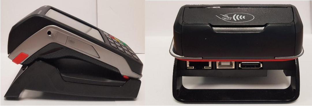
Move/5000 on Base