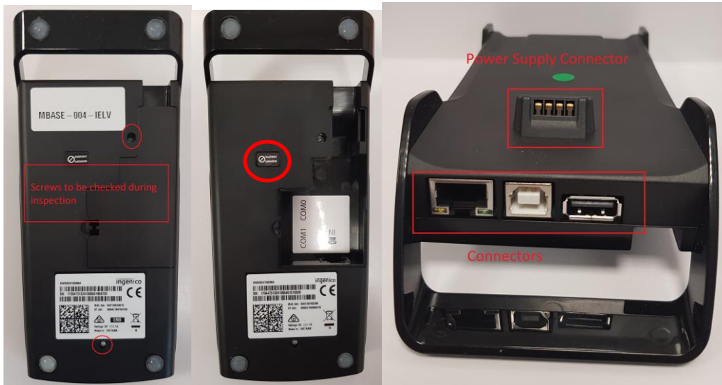
Base with Cover