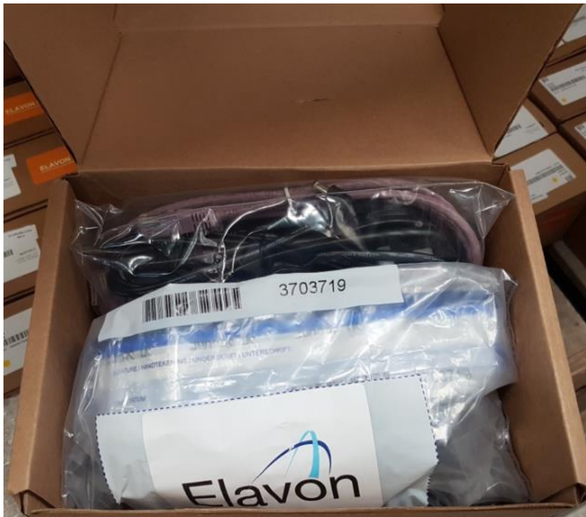
POI Device with TEE in opened box