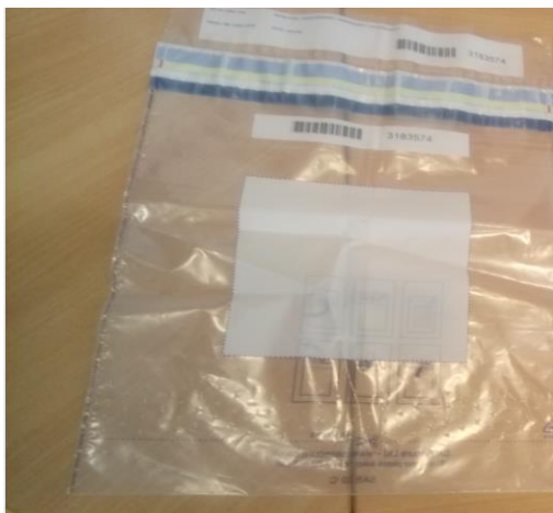
Tamper Evident Envelope (TEE)

Courier Delivery or Engineer Pre-Configured installed POI devices will be in a Tamper Evident Envelope and then placed within its original box please be advised that the TES of the original box will be broken.