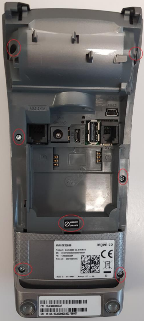
Rear View Casing Open