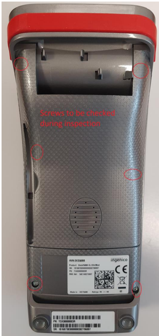
Rear View Casing Closed